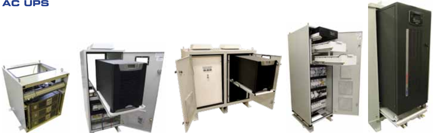
500VA - 3kVA