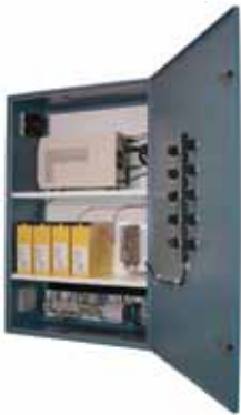
1 - 3kVA Wall Mount IP54 UPS