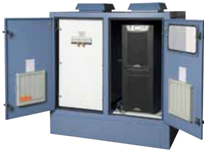
1 - 30kVA Floor Standing IP54 UPS