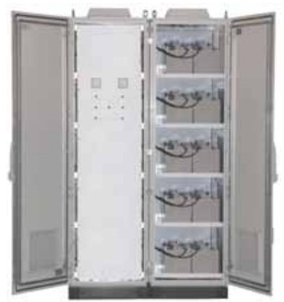
1 - 200kW Floor Standing IP54 DC UPS

Harland Simon UPS Ltd • Bond Avenue • Bletchley • Milton Keynes • MK1 1TJ T: 01908 56 56 56 • E: enquiries@hsups.co.uk • W: harlandsimonups.com