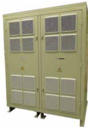
100 - 600kVA Floor Standing IP54 UPS