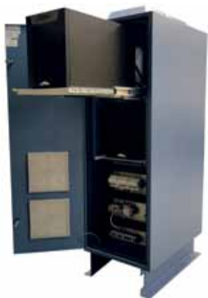
1 - 5kVA Floor Standing IP54 UPS