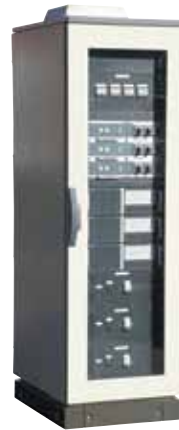
1 - 120kVA 19" Rack IP54 UPS