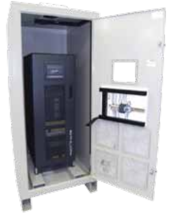
1 - 120kVA Floor Standing IP54 UPS