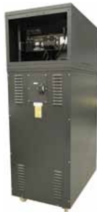
1 - 11kVA Floor Standing Long Runtime IP21 UPS