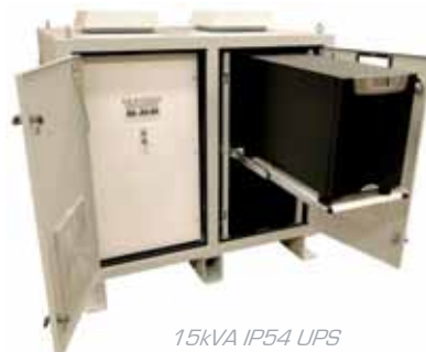
15kVA IP54 UPS