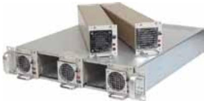
Astor N+1 DC PSU

Applications: radar, communications, control