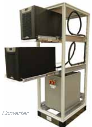
10kVA N+1 Converter

Harland Simon UPS Ltd • Bond Avenue • Bletchley • Milton Keynes • MK1 1TJ T: 01908 56 56 56 • E: enquiries@hsups.co.uk • W: harlandsimonups.com