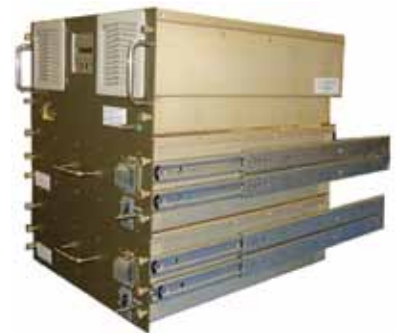
7kVA Vehicle UPS