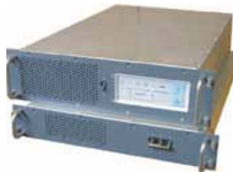
6kVA Ship UPS