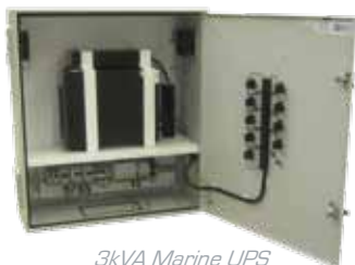
3kVA Marine UPS