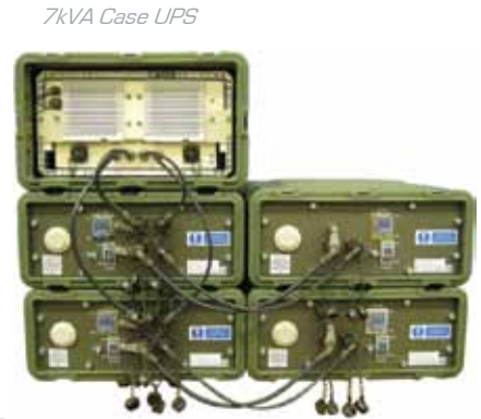
7kVA Case UPS