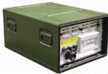
3kVA Case UPS

Applications: field communications, security