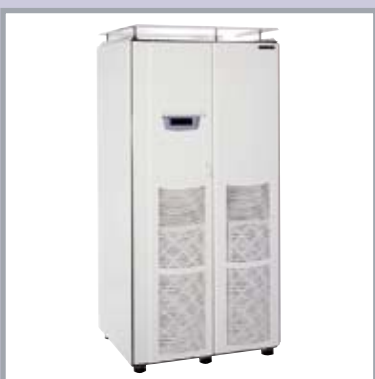
9390 M | 40 - 160kVA