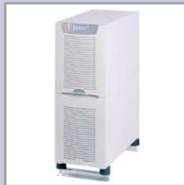
9155 M | 8 - 30 kVA