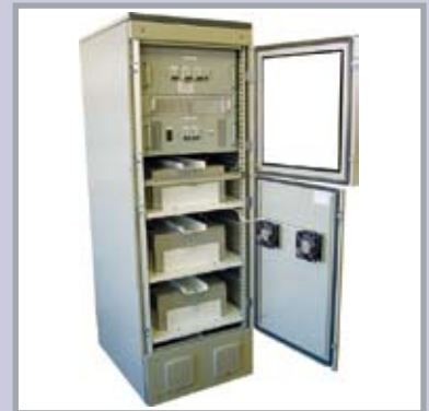
19" Rack AC UPS