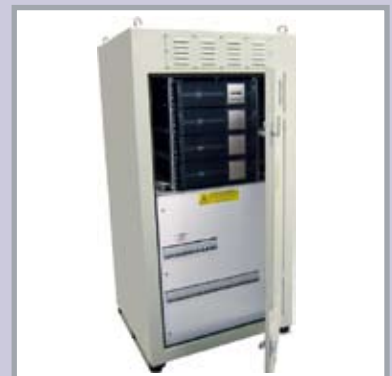
Floor AC UPS