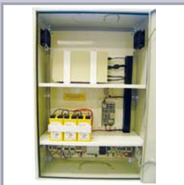
Wall AC UPS