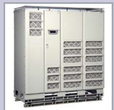
9395 M | 225 - 1100 kVA