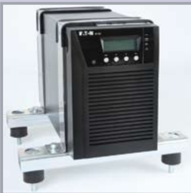
9130 M | 1 - 3 kVA (DNV)