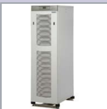
9355 M | 8 - 40 kVA