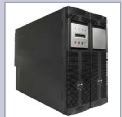
EX RT | 5 - 11 kVA