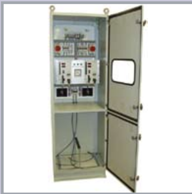
Dual DC Charger