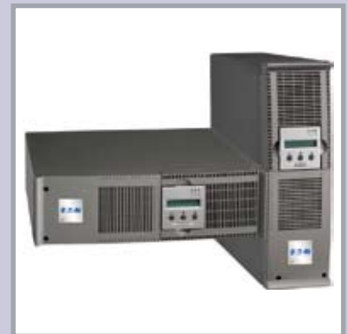
EX M | 1 - 3 kVA (DNV)