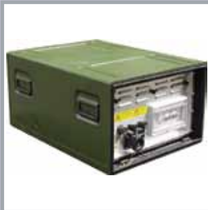
Case Mounted UPS