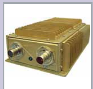
DC Power Supplies