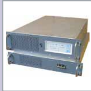
19" Rack Mounted